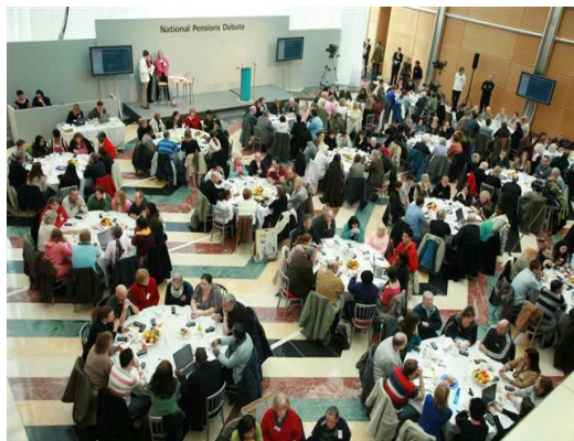
National Pensions Day, London

department for children, schools and families