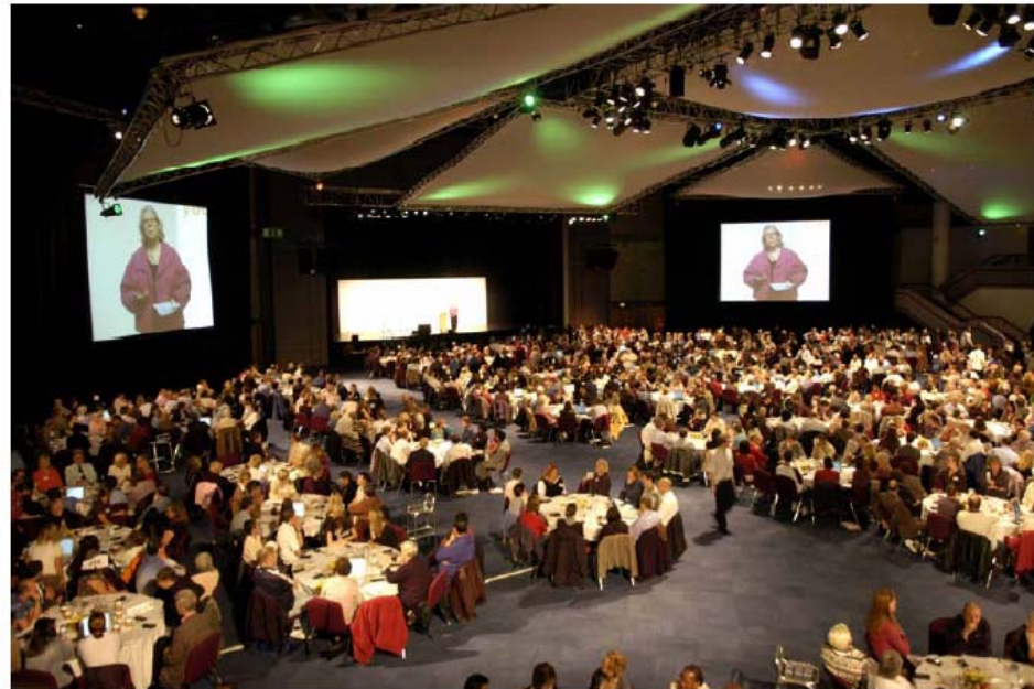
Your Health, Your Care, Your Say Birmingham, October 2005