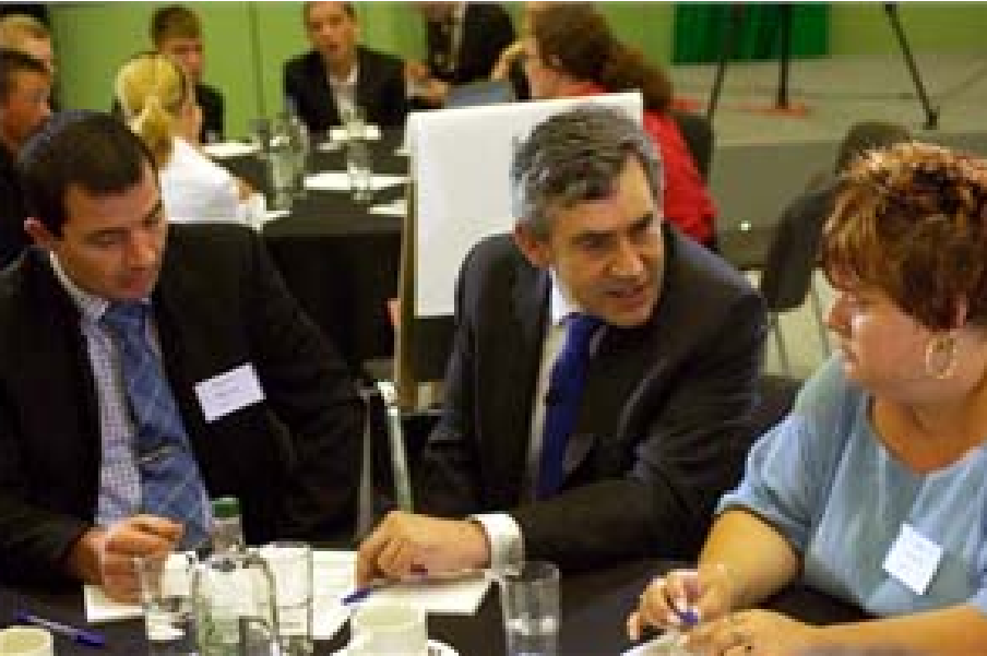
PM's First Citizens Jury on Children's Priorities Bristol, 6 September 2007

“I have learnt a lot in the last ten years. I have learnt that top-down pulling of the lever solutions are not always the ones that are going to work best..... Government has to work with people”