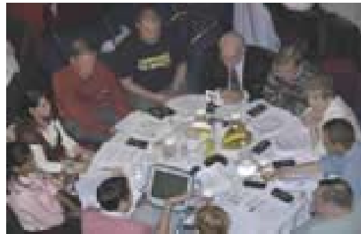
Participants at the Citizens' Summit in Birmingham

TALKINGENERGY the future of nuclear power